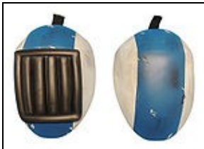
Shoulder Armor For 501st approval: