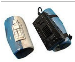
Forearm Armor For 501st approval: