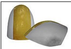
Shoulder Armor For 501st approval: