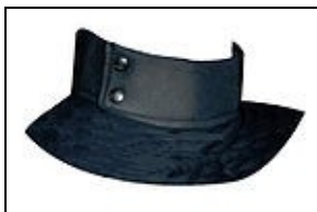
Neck Seal For 501st approval: