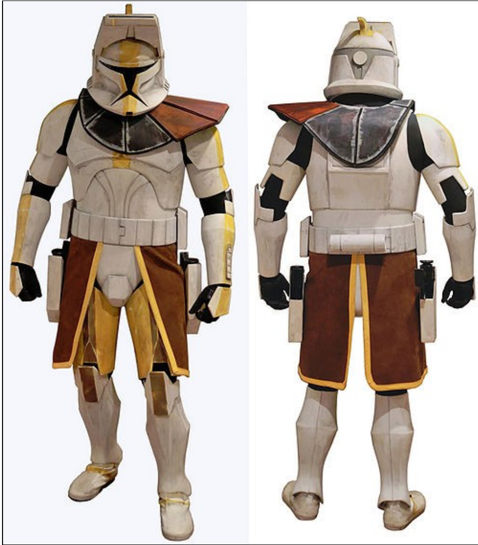
Model Commander Bly