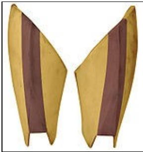
Thigh Armor For 501st approval: