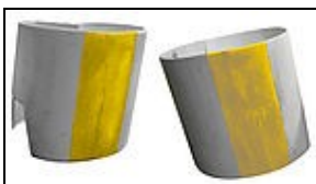
Upper Arm Armor For 501st approval: