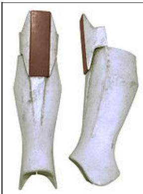
Lower Leg Armor For 501st approval: