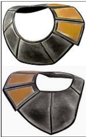
Pauldron For 501st approval: