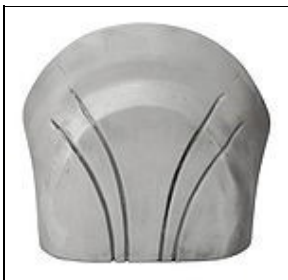
Abdomen Armor For 501st approval: