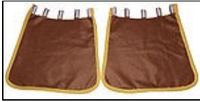
Kama For 501st approval: