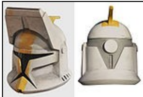
Helmet For 501st approval:

The following costume components are present and appear as described below.