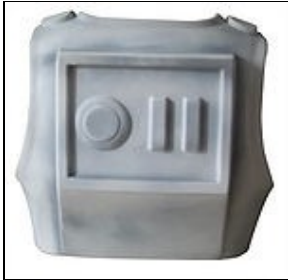
Back Armor For 501st approval: