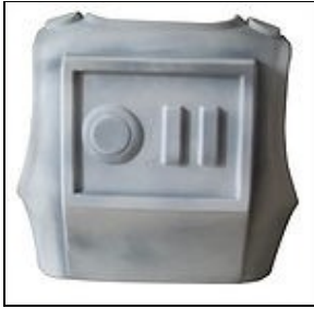
Back Armor For 501st approval: