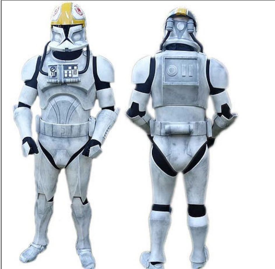
Model CP-8995 Ken Seymour