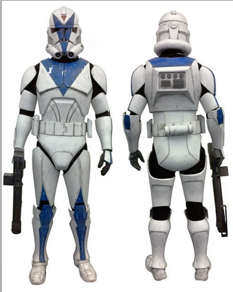
Model CT 9512