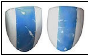
Shoulder Armor For 501st approval: