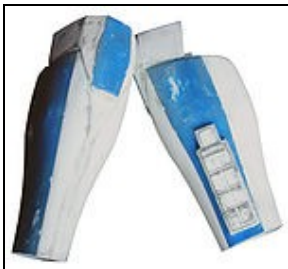
Forearm Armor For 501st approval: