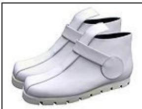
Boots For 501st approval: