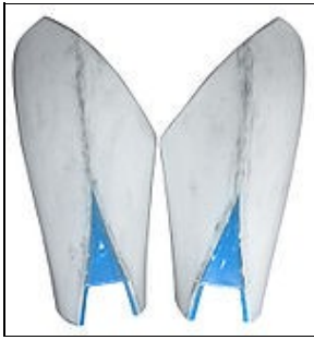
Thigh Armor For 501st approval: