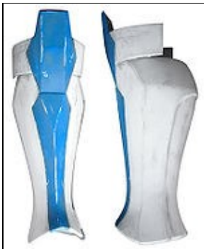
Lower Leg Armor For 501st approval: