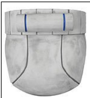
Posterior Armor, belt rear and detonator For 501st approval: