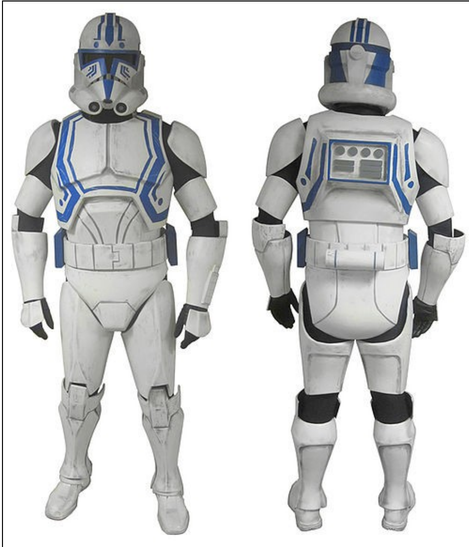
Model CT 9415