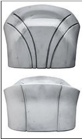
Abdomen Armor For 501st approval: