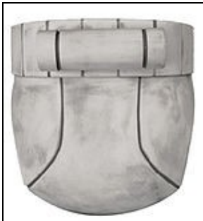
Posterior Armor, belt rear and Detonator For 501st approval: