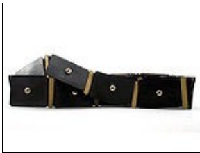
Belts For 501st approval: