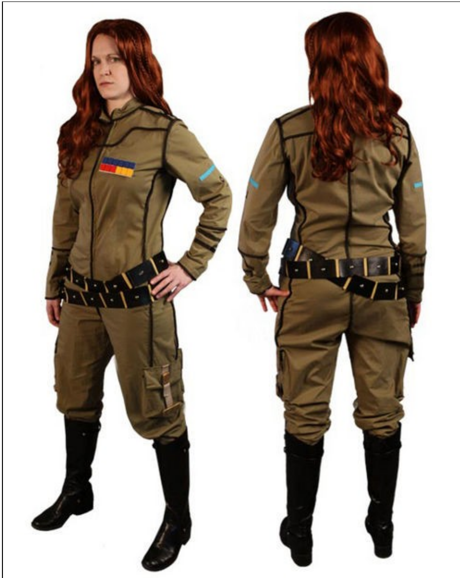
Model ID-3881, Photo by Trent Thornton