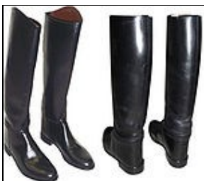
Officer Boots For 501st approval: