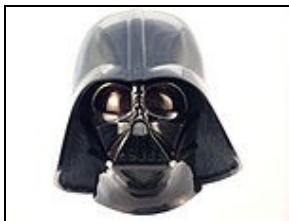
Dome For 501st approval:

This document is a Work In Progress being used to restructure the SLD CRL. It should not be used for approval purposes.