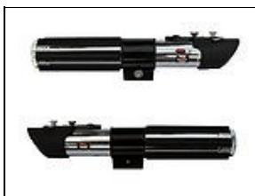
Lightsaber For 501st approval: