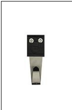
Lightsaber Hook For 501st approval: