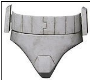
Codpiece and Belt front For 501st approval: