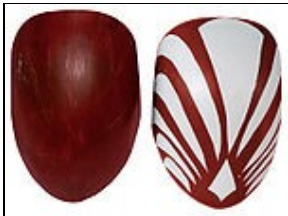
Shoulder Armor For 501st approval: