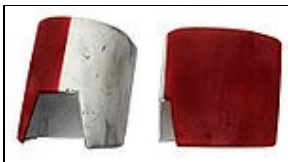
Upper Arm Armor For 501st approval: