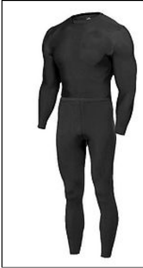
Under Suit For 501st approval: