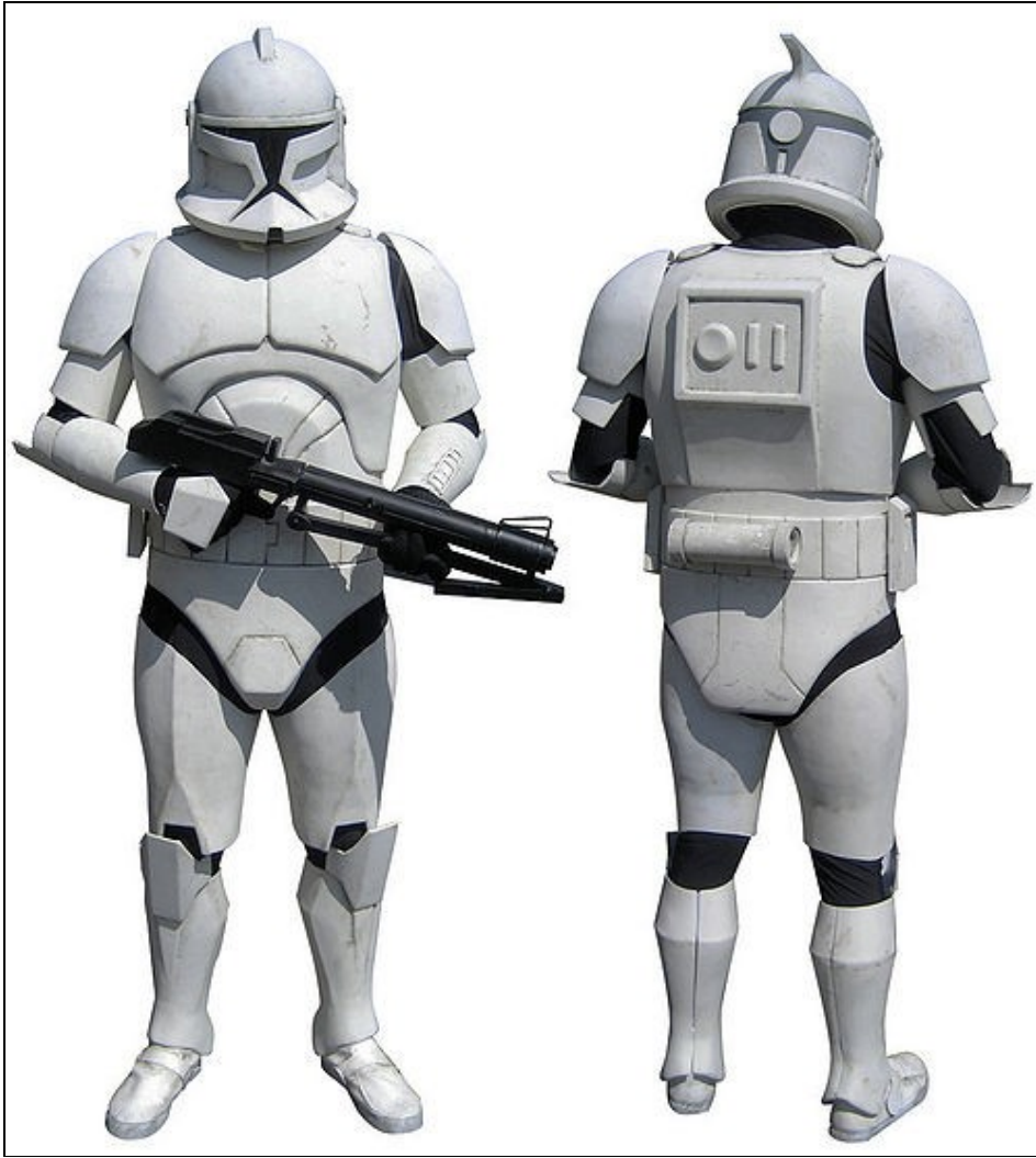
Model TC 7602