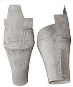
Forearm Armor For 501st approval: