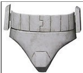
Codpiece and Belt front For 501st approval: