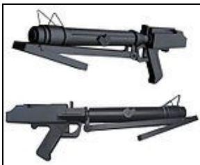
DC-15S Blaster Carbine (animated style) For 501st approval:

Items below are optional costume accessories. These items are not required for approval, but if present appear as described below.