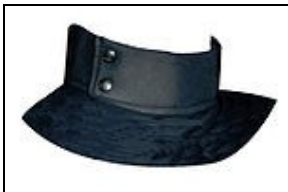
Neck Seal For 501st approval: