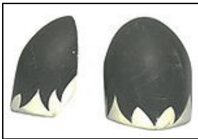
Shoulder Armor For 501st approval: