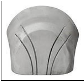
Abdomen Armor For 501st approval: