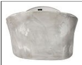
Kidney Armor For 501st approval: