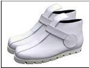
Boots For 501st approval: