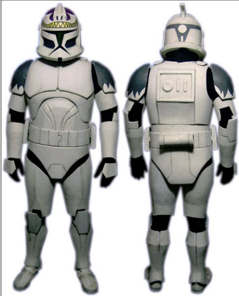
Model TC 7602