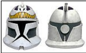
Squawk Helmet For 501st approval:

The following costume components are present and appear as described below.