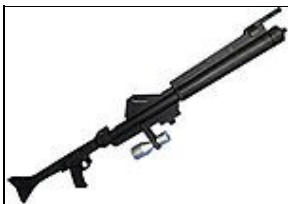
DC-15A Blaster Rifle (animated style) For 501st approval:

Manufactured by BlasTech Industries, this blaster is the standard issue weapon carried by the Clone Troopers of the Grand Army of the Republic.