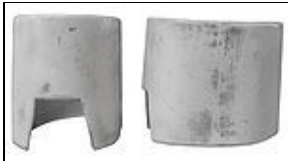
Upper Arm Armor For 501st approval: