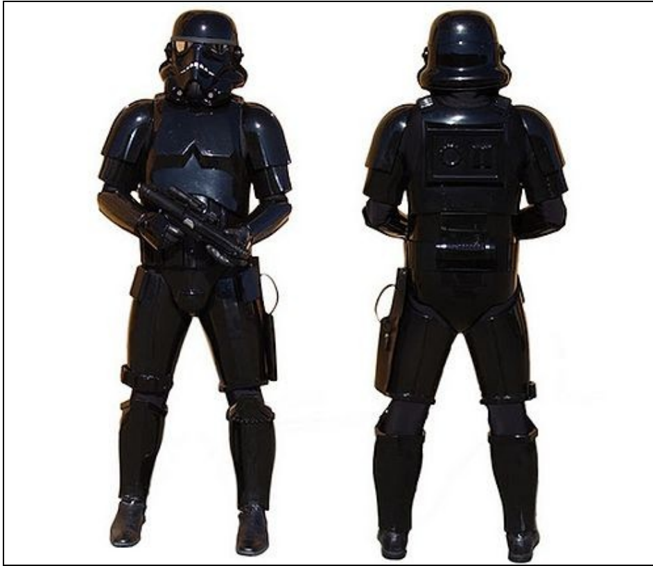
Model TX-5575