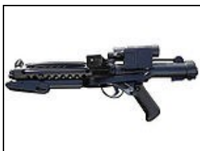
BlasTech E-11 For 501st approval:

For level three certification (if applicable):