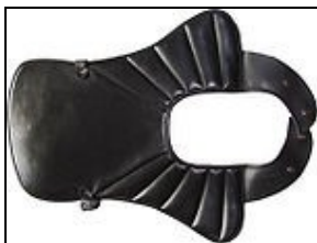
Black Pauldron For 501st approval:

Items below are optional costume accessories. These items are not required for approval, but if present must meet the guidelines below.