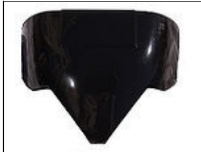
Butt Plate For 501st approval: