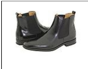
Boots For 501st approval: