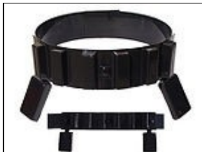
Belt For 501st approval: