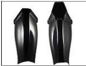
Shin Armor For 501st approval: