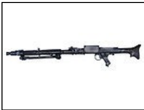
BlasTech DLT-19 Heavy Blaster Rifle For 501st approval:

For level three certification (if applicable):