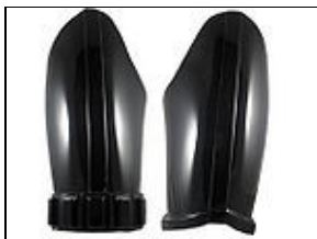
Thigh Armor For 501st approval: