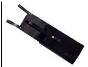
Holster For 501st approval: