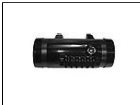
Thermal Detonator For 501st approval: